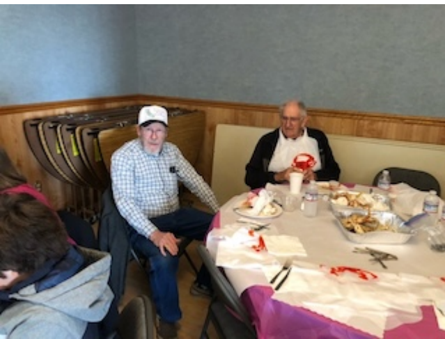
Our donations to help the community.