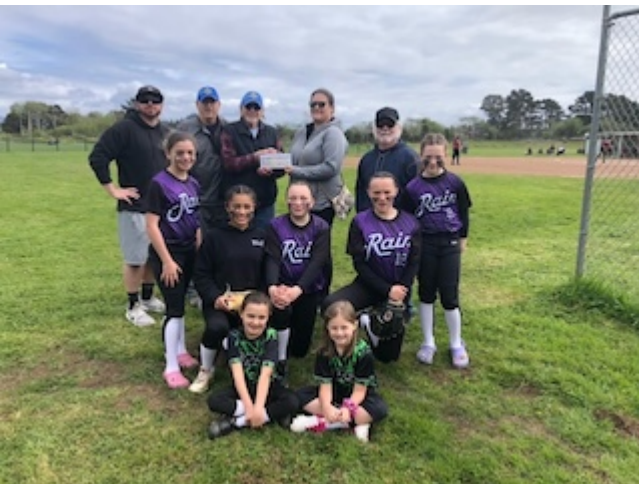
Humboldt Girls Fast Pitch Softball – The " Rain". $500'